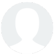
Eric Redfin Corporation