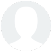
Gerry O'Connor Realty Group