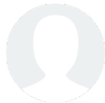
Peter First Weber, Inc.