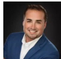
Kevin Adashun Jones, Inc.