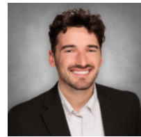
Ben Adashun Jones, Inc.