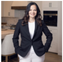
Sarah Adashun Jones, Inc.