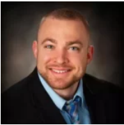
Steven Adashun Jones, Inc.