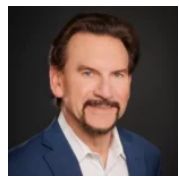
Frank Adashun Jones, Inc.

Spectacular water views from this 3BR and 1.5 bath dwelling, with 120 ft of prime frontage along the West shore of Lake Winnebago! This is a renovation, or raze and build project, as property has not been occupied. Great potential and priced below assessed value!