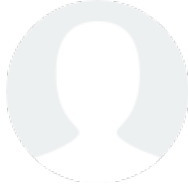
Chris C. Klapperich Real Estate, Inc.