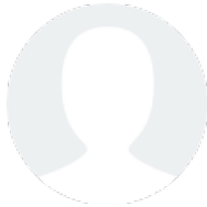
Christine Klapperich Real Estate, Inc.