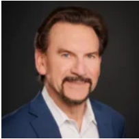
Frank Adashun Jones, Inc.