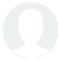
Megan Acre Realty, Ltd.