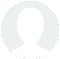
Dave AXEN Realty, LLC