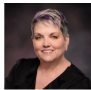
Maigon Adashun Jones, Inc.