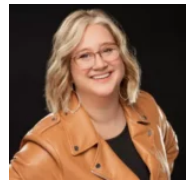
Laura Adashun Jones, Inc.