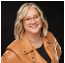
Laura Adashun Jones, Inc.