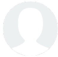
Thomas First Weber, Inc.