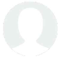
Robin First Weber, Inc.