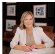
Jan Adashun Jones, Inc.