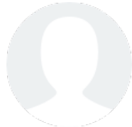
Kevin Ruesch Realty