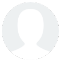
Robin First Weber, Inc.