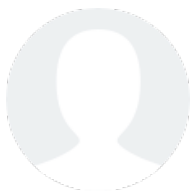
Thomas First Weber, Inc.