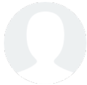
Jared Real Broker LLC