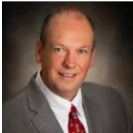
Scott Adashun Jones, Inc.