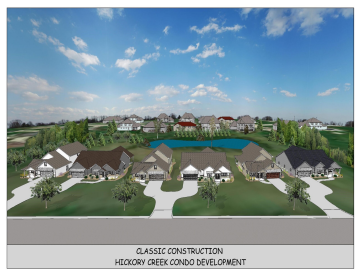
CLASSIC CONSTRUCTION HICKORY CREEK CONDO DEVELOPMENT