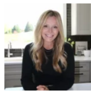
Kelly Adashun Jones, Inc.