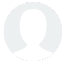
Robin First Weber, Inc.