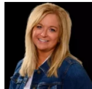
Colette Adashun Jones, Inc.