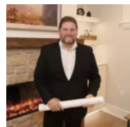
Glenn Adashun Jones, Inc.