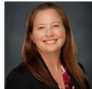
Kate Adashun Jones, Inc.