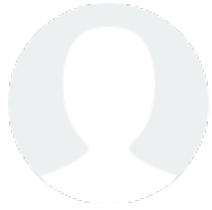
Karen Broadway Real Estate