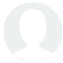
David Roberts Homes and Real Estate