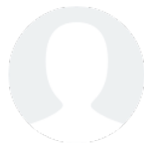
Ryan Corbett Realty