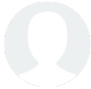
David Roberts Homes and Real Estate