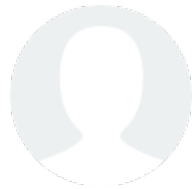
Robin First Weber, Inc.