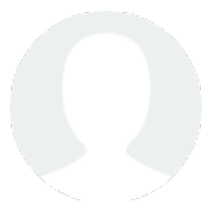
Tyson Adashun Jones, Inc.