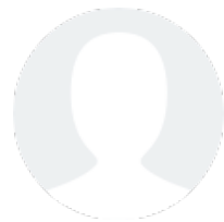
Jason Jason Gerhard & Associates Real Estate