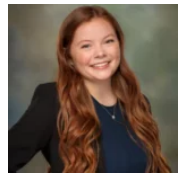
Molly Adashun Jones, Inc.