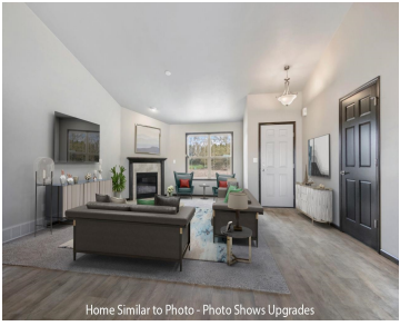
Home Similar to Photo - Photo Shows Upgrades