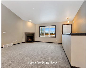
Home Similar to Photo