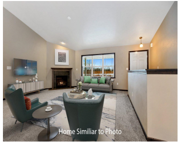
Home Similar to Photo