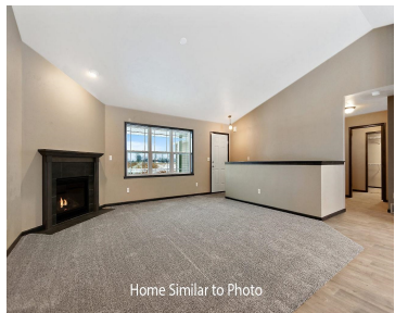
Home Similar to Photo