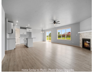
Home Similar to Photo - Photo Shows Upgrades