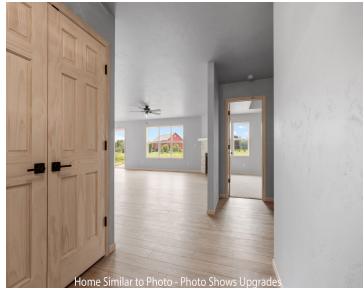
Home Similar to Photo - Photo Shows Upgrades