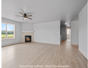
Home Similar to Photo - Photo Shows Upgrades