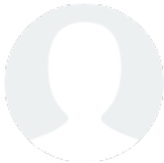
Tom Score Realty Group, LLC