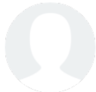
Nikki Coaction Real Estate, LLC