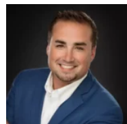
Kevin Adashun Jones, Inc.