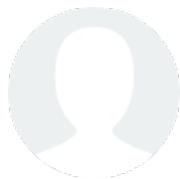
Mari OK Realty