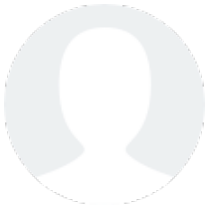
Ryan Foley Real Estate Group, LLC