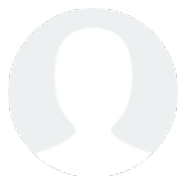
Cathy Roberts Homes and Real Estate