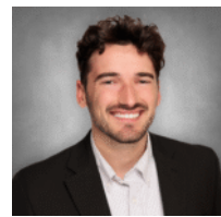
Ben Adashun Jones, Inc.