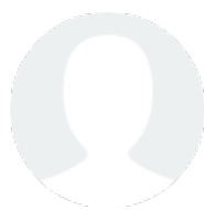
Sharon Adashun Jones, Inc.