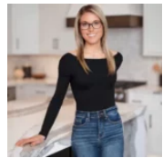
Jada Adashun Jones, Inc.