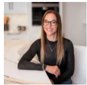
Jodi Adashun Jones, Inc.