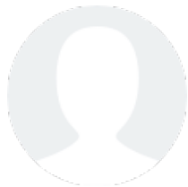
Debbie Broadway Real Estate