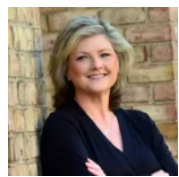
Vicki Adashun Jones, Inc.