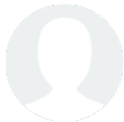
Listing Adashun Jones, Inc.