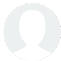
Tim Besaw Properties, Ltd