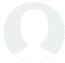
Tim Besaw Properties, Ltd