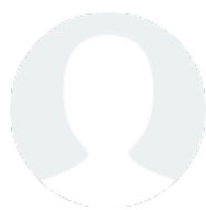
Tom Adashun Jones, Inc.